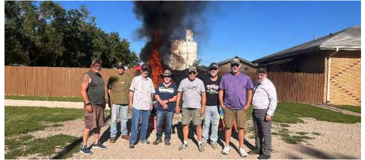
McPherson American Legion Post 24 retired 1200 flags on June 13th. Thank you to all the volunteers who helped to make this a meaningful ceremony.