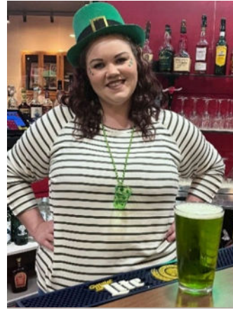
Photo: Celebrating St Patrick's Day at American Legion Post 24

fallis/stockham Syndrome performing to a full house in Lounge on March 28